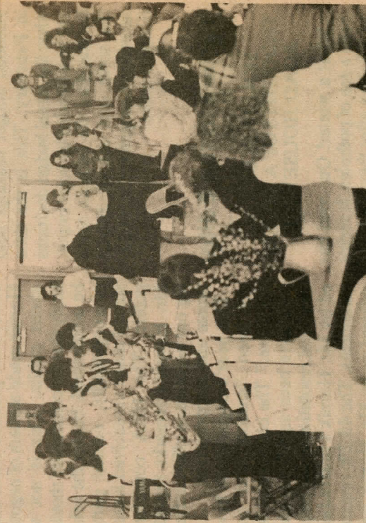
The Hollis AREA High School Jazz Band performed during intermissions at the Hollis Town Band Pops Concert held this past Sunday.