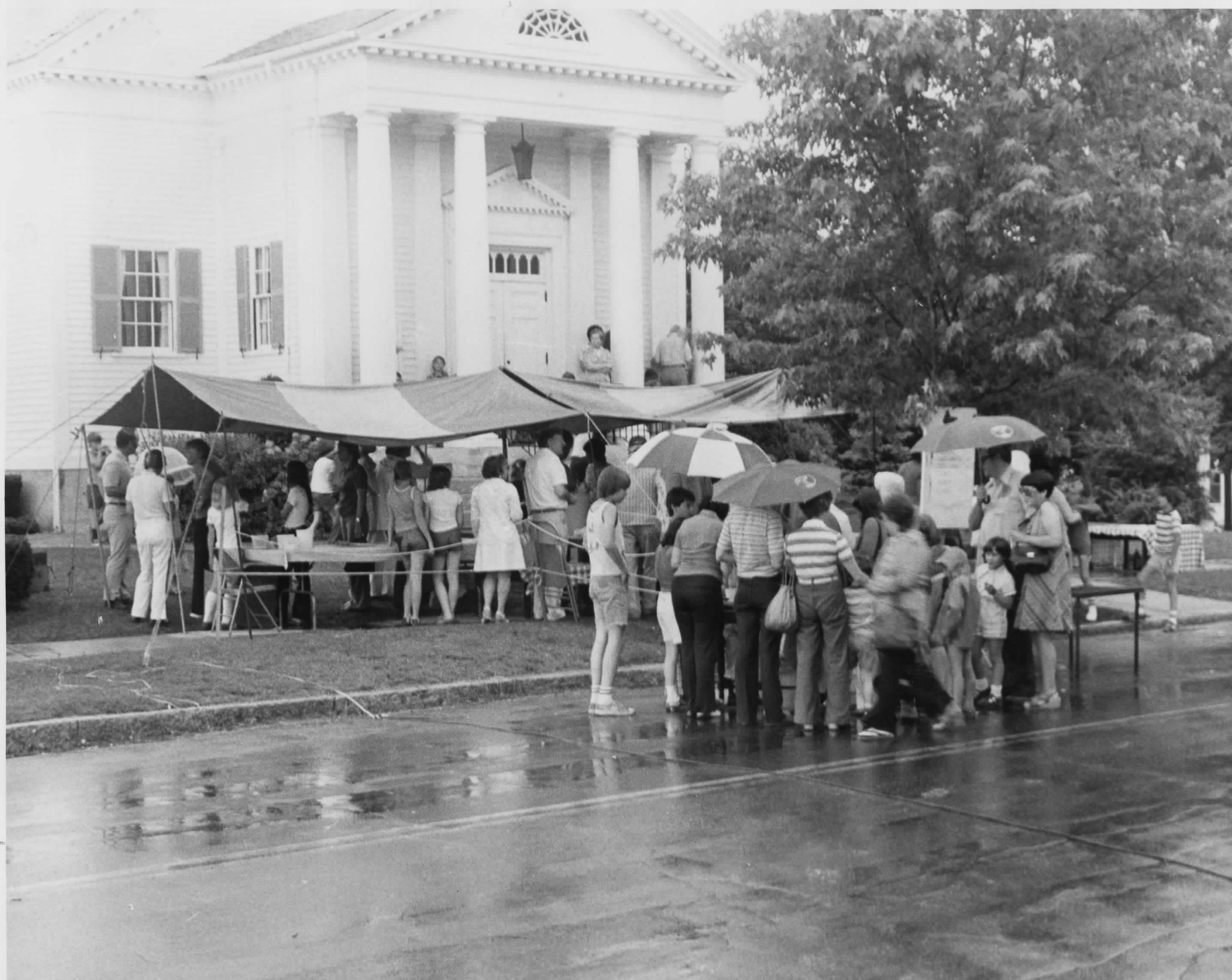
Strawberry Festival 1977 - First Rainy Festival -